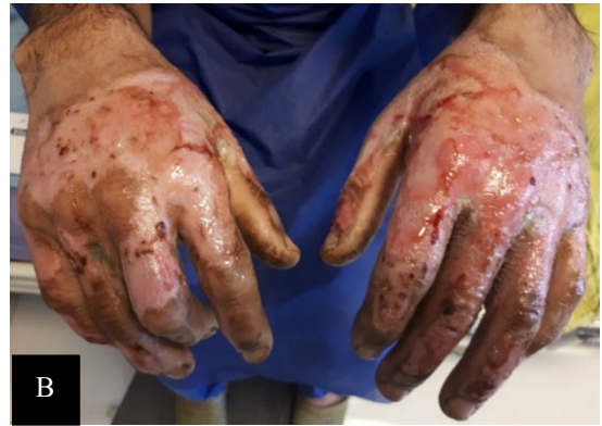
Fig. 2. Case 2: Treatment of the right hand with L. plantarum supernatant and the left hand with silver sulfadiazine: A) after 48 h and B) after 7 days of treatment