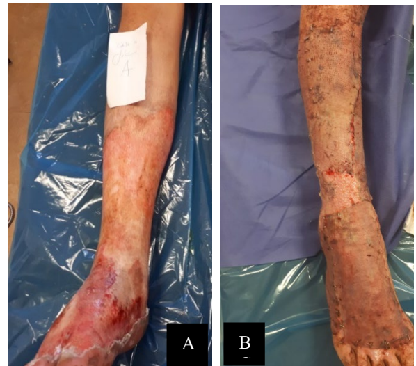
Fig. 3. Case 17: Treatment of the right foot with L. plantarum supernatant: A) after 48 h and B) after 10 days of treatment as well as after skin grafting

The patient was a 30-year-old man with deep second-degree burn wounds on both feet, including the legs, ankles, and upper part of the feet. The percentage of TBSA was 18%, with dermis and epidermis involvement and skin discoloration. The patient received daily ointment containing L. plantarum supernatant on his right foot and silver sulfadiazine ointment on his left foot for 10 days. The patient received skin grafts on both feet. Before skin grafting, the cultures of the wound on both feet were negative. The skin graft on the right foot receiving the probiotic supernatant was successful (Figure 3).